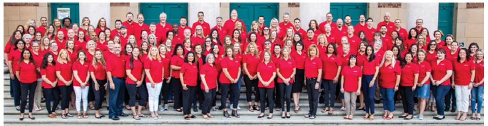
The 2019 Academy class had 136 total registrants.

Both chamber staff and chief executive officers are eligible. Applicants must be employed by a chamber and be a current member of W.A.C.E.