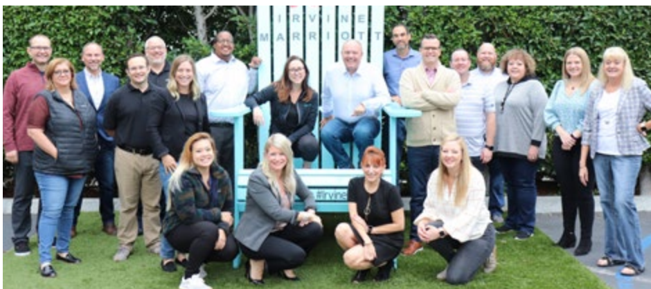
Members of the W.A.C.E. Board of Directors and Emerging Leaders Council met at the Irvine Marriott in Irvine, CA for their Board meeting and planning session on October 21.