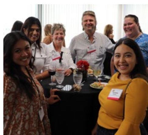
Academy kicks off with a welcome reception Sunday at the CalChamber, giving participants an opportunity to collect their event items and meet other attendees before the start of classes.