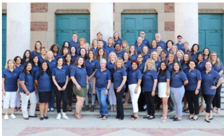
62 students started their Academy journey attending their first year in 2022.