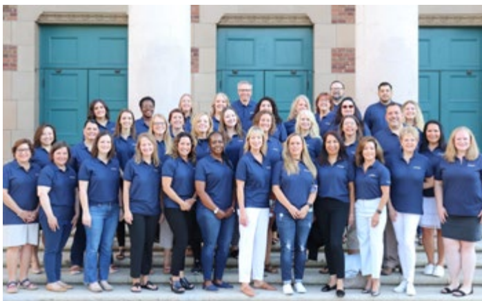
37 students returned for their second year of classes.