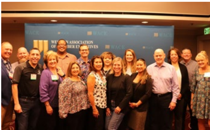
Seventeen Academy alumni joined us for a two-day Academy Plus program focused on future proofing your chamber, next level financing for chambers, and balance, boundaries and burnout.