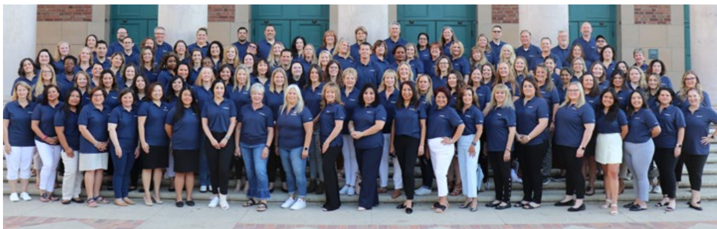
118 chamber executives and staff from around the West attended Academy 2022 in Sacramento, CA on August 3–5.