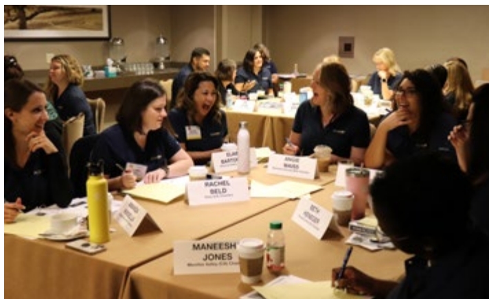
Second year students laugh together during a group discussion as a part of their Keeping Your Chamber Relevant class.