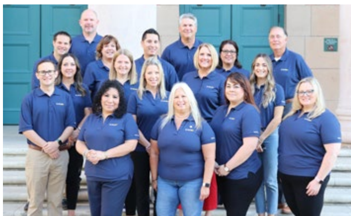
19 students returned for their final year of classes. Their class will graduate at the 2023 Annual Conference in February.