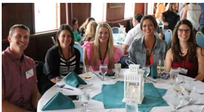
Academy and Academy-Plus attendees get together on Monday night for a dinner and networking event aboard the Delta King riverboat.