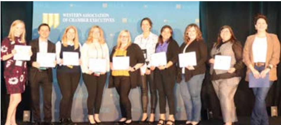
The new members of the Emerging Leaders Council were announced and presented with their certificates during the Monday lunch session. A full list of council members can be found at https://www.waceonline.com/emergingleaders.html