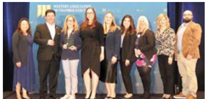
The staff of the Greater Irvine (CA) Chamber accept the award for Outstanding Achievement in Overall Communications.