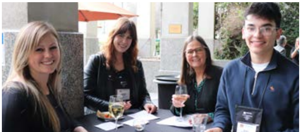
Monday night the Executive Committee and Emerging Leaders Council hosted a New Member & First-Time Attendee Reception. The event included a fun W.A.C.E. Bingo networking game providing first-time attendees, board members and the council with a fun way to connect.